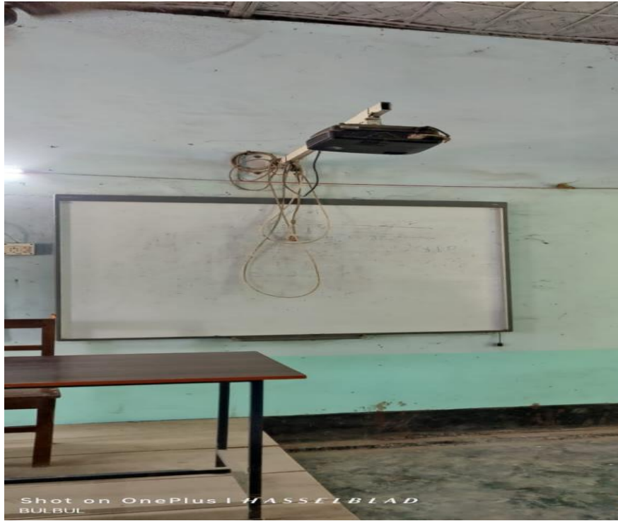
Classroom No- 10