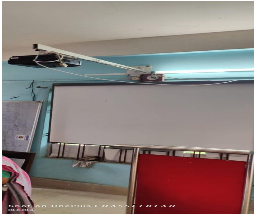
Classroom – 33