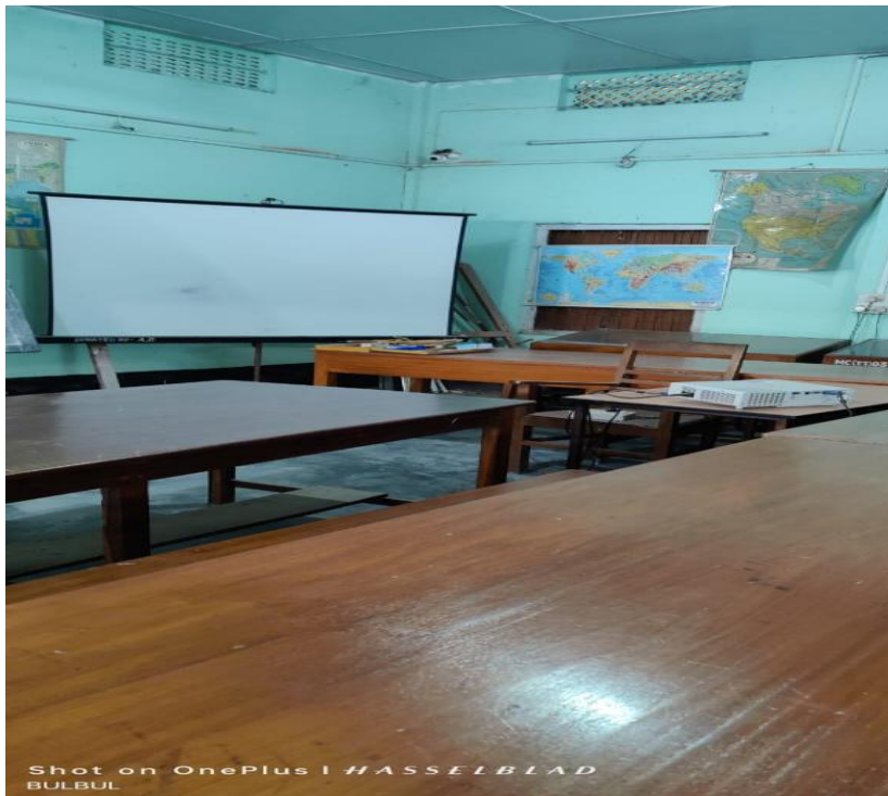
Geography Dept. Lab